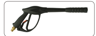
High pressure gun

Hose connector, H.P. Nozzle Professional pipe cleaning nozzle 1500 mm lance with adjustable head 1700 mm lance with adjustable head 1500 mm lance with adjustable head 2000 mm lance with adjustable head s/s rotary floor cleaning lance Hose / gun quick coupling set